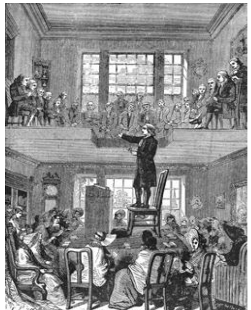
John Wesley preaches in the meeting house of Mathew Bagshaw in Nottingham, England, in 1747.